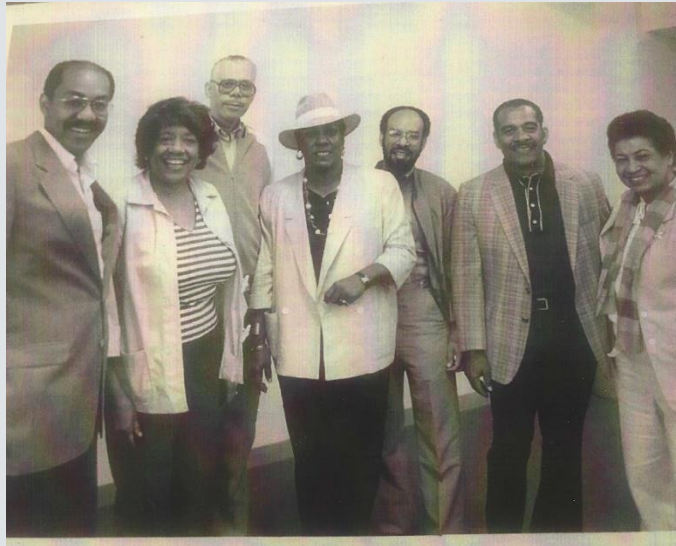
Past Presidents and Executive Secretaries c.1992